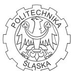
Silesian University of Technology